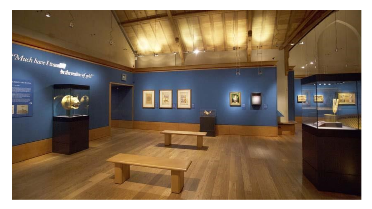
The exhibition is displayed in the main open space around the staircase bannister: