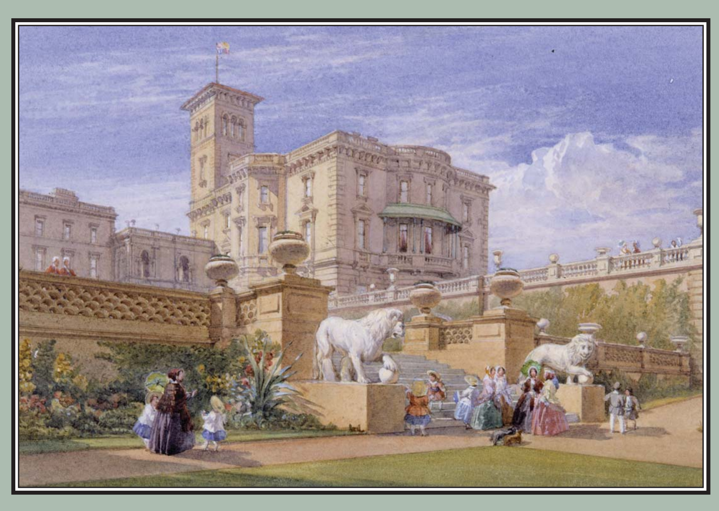
Osborne House from below the terrace, William Leighton Leitch

We agreed that we could never be thankful enough to have got this place, which is the source of such comfort, independence, enjoyment and occupation. Journal, 10 December 1847