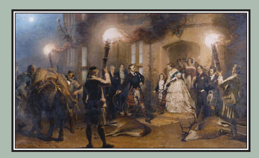
Evening at Balmoral, Carl Haag

For the Queen, Balmoral offered the freedom to pursue her hobbies, enjoy the country air and the peace and quiet.